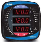
Eaton IQ 250/260

The 460MX currently supports the following Power Meters: