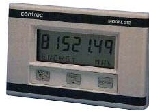
Contrec BTU 212