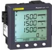
Power Logic 820U