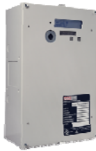
Quadlogic MiniCloset 5 Multi-Tenant