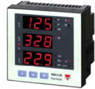
Carlo Gavazzi WM14